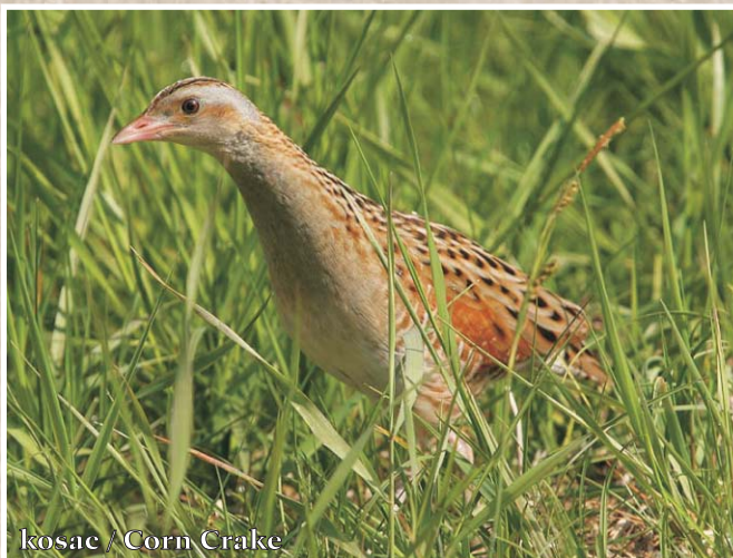
kosac / Corn Crane

Natural grazing by large herbivores (plant eaters) is a landscape forming process like erosion and sedimentation by rivers. The wild ancestors of our bovines and horses, the Aurochs and European wild horse, roamed freely through Europe until they became extinct. With the pasturing of domestic bovines and horses in nature, grazing was still part of nature until developments in agriculture caused the disappearing of those pastures almost everywhere in Europe. To restore the relationships between large grazing animals and nature, autochthonous breeds which are well adapted to the local situation will be re-introduced in nature which is called natural grazing.